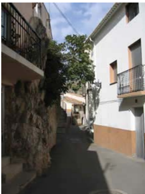
street built into the rocks in Confrides

From Abdet follow the road out towards the main road, you pass some very well tended olive and almond groves. It is also worth stopping to look down into the Barranco (canyon) - you will see some unusual ridges of rubble carved by the stream. Soon you arrive at the bridge over the barranco. Be careful as the drops between the parrapets are un-guarded. Immediately on the other side take a small track on the right side leading to a ruined hut. You are now on the old mule trail between Abdet and Confrides, note the stone steps and terraces as you pass through more well tended "Campos".